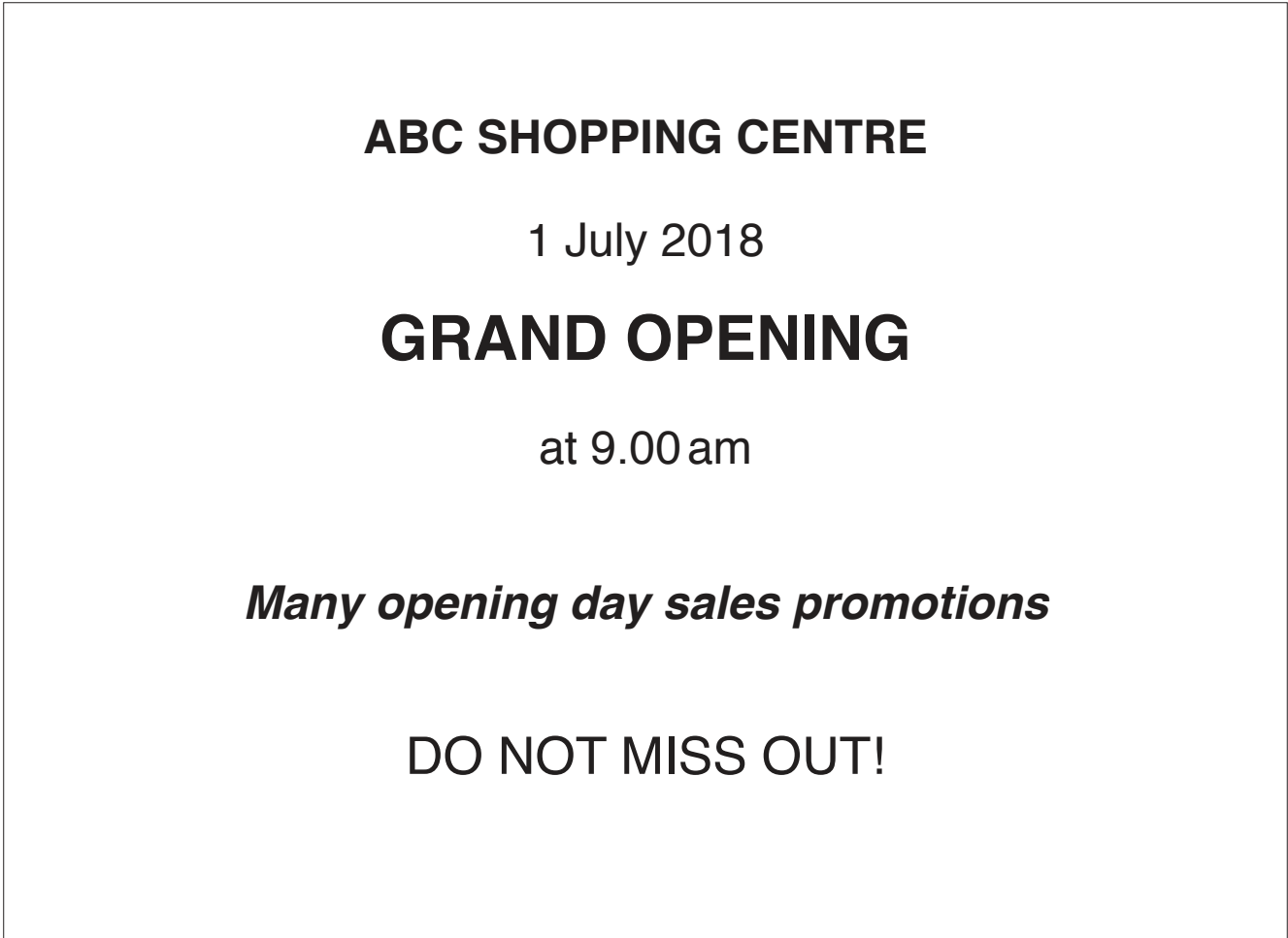
Fig. 2 Local newspaper advertisement

Use Fig. 2 to help you answer the following questions.